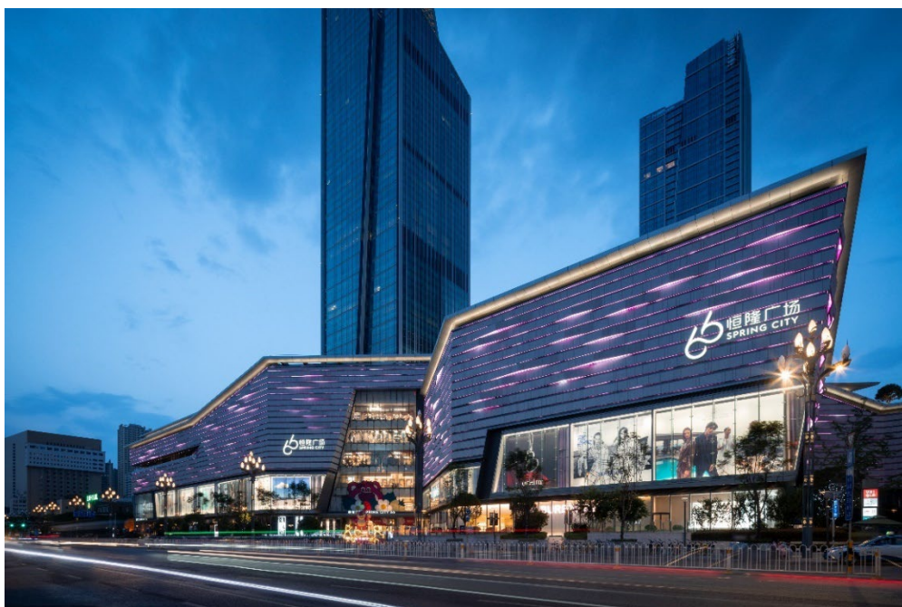
Designed to “Bring the Best to Kunming; Showcase the Best of Kunming to the World”, Spring City 66 is Hang Lung’s first development project in Southwest China