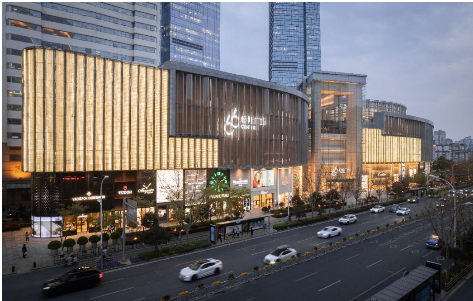
Located in the most prosperous commercial district in downtown Wuxi, Center 66 is the city’s center of luxury