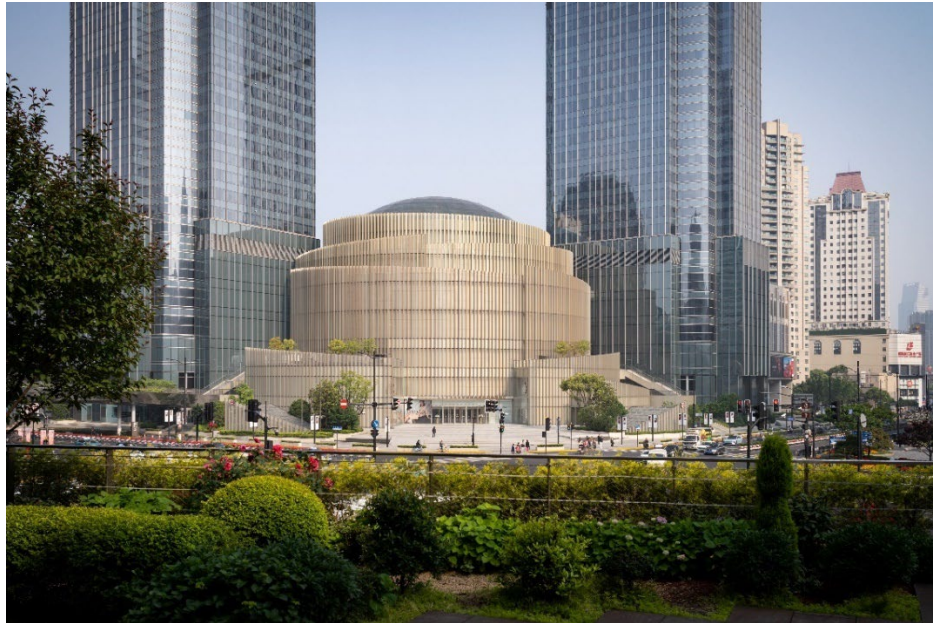
Grand Gateway 66, Shanghai boasts a spectrum of global luxury brands, many of which have made their China debuts, successfully establishing its position as the “Gateway to Inspiration”