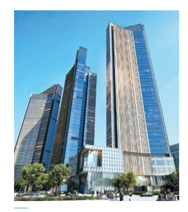
HEARTLAND 66, WUHAN