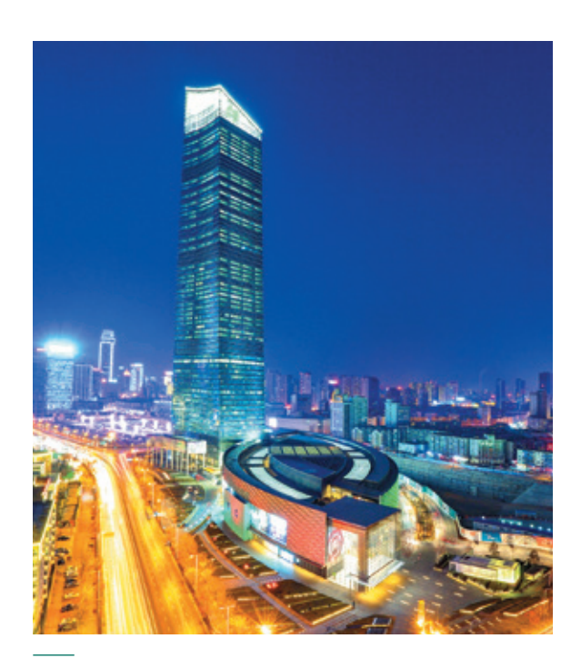
FORUM 66, SHENYANG