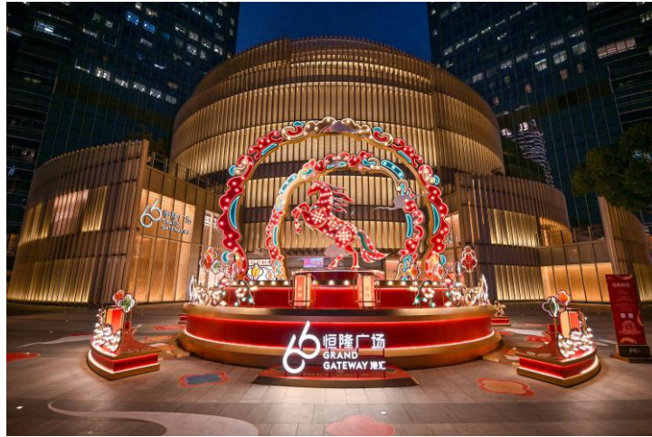
The Chinese New Year campaign across ten “66” malls in eight Mainland cities kicks off Hang Lung’s 66 th anniversary celebrations