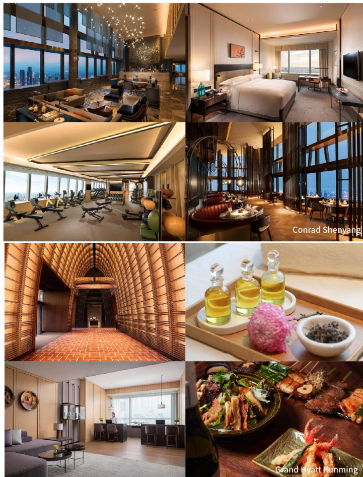
Conrad Shenyang and Grand Hyatt Kunming have launched the “66 and beyond” hotel offers