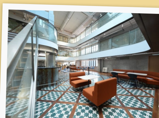
Atrium Work Café

升级改做而成的接待柜台 位于24楼的接待柜台由回收的榕树树干升级改做而成。 Upcycled Reception Counter The 24th floor reception counter is upcycled from a salvaged Banyan tree trunk.