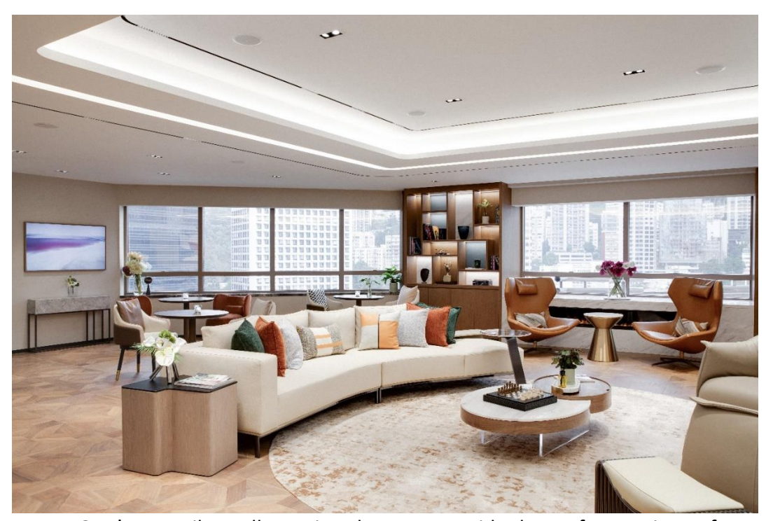
NET•WORK's versatile, well-appointed venues provide the perfect setting to forge connections and showcase businesses