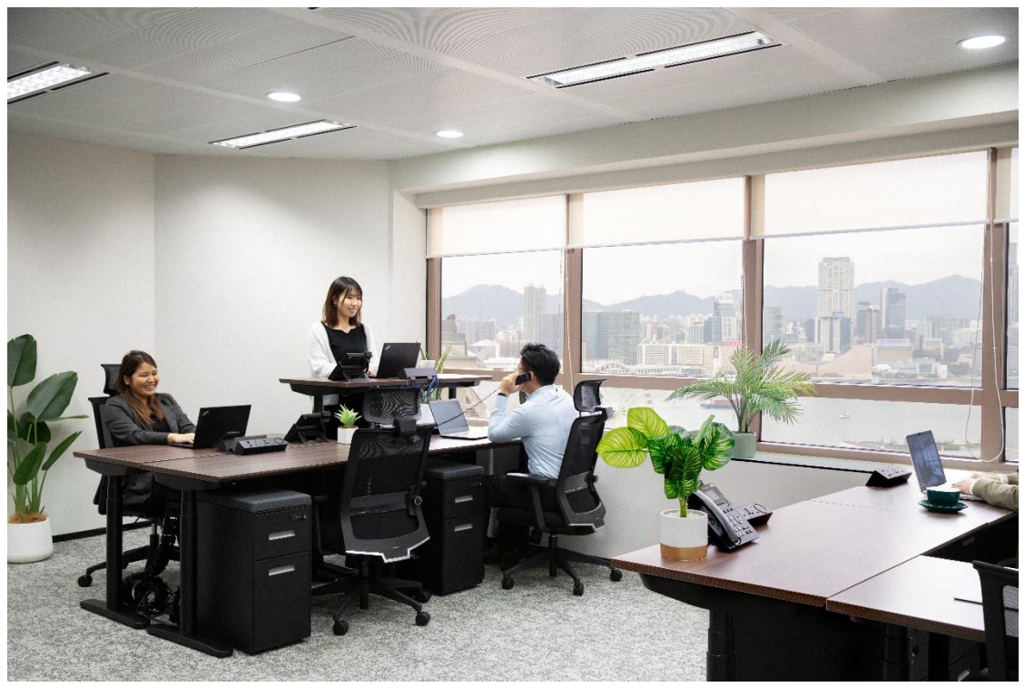
All workstations are equipped with ergonomic chairs and height-adjustable desks featuring USB-C monitor compatibility