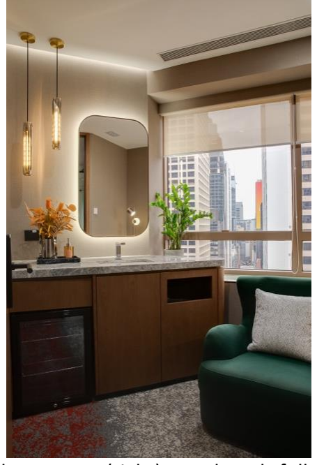
Various amenities, including the pantry (left) and wellness room (right), are thoughtfully designed to enhance the wellbeing of office workers