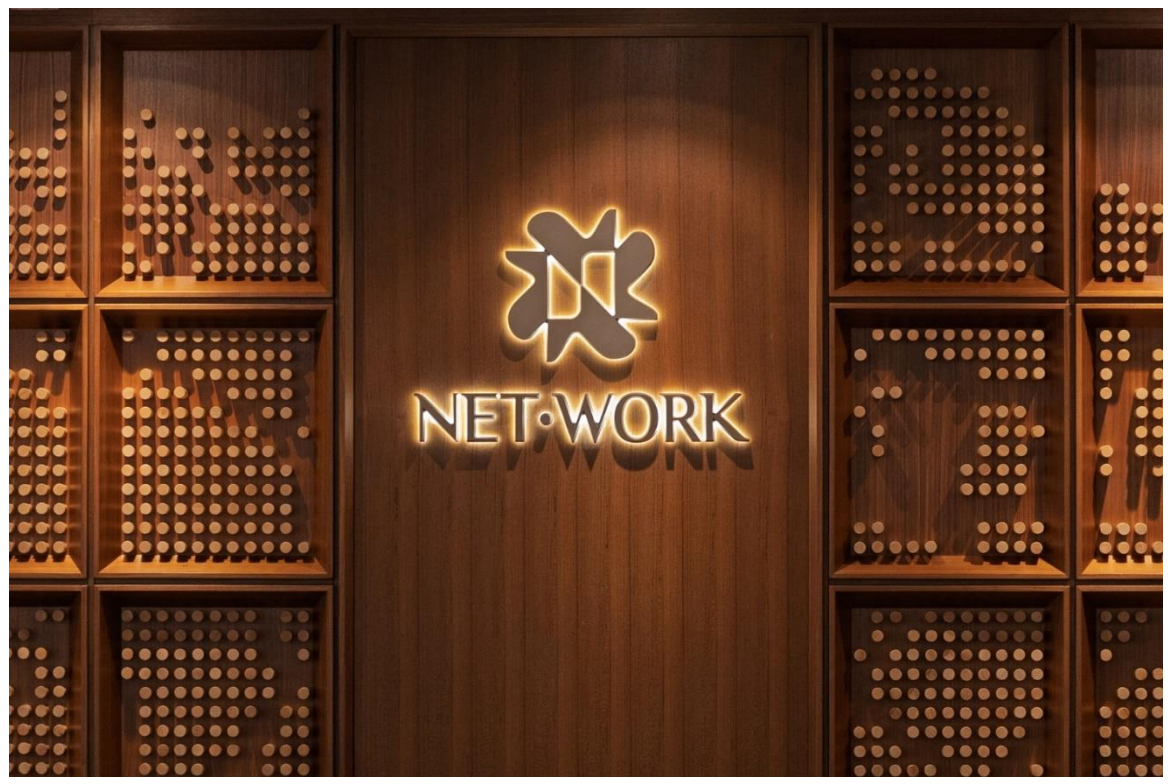
NET•WORK represents the connection, a hub for businesses to grow, and for people to connect and be inspired