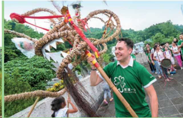
Volunteers accompany primary school students to learn about unique traditional arts and crafts