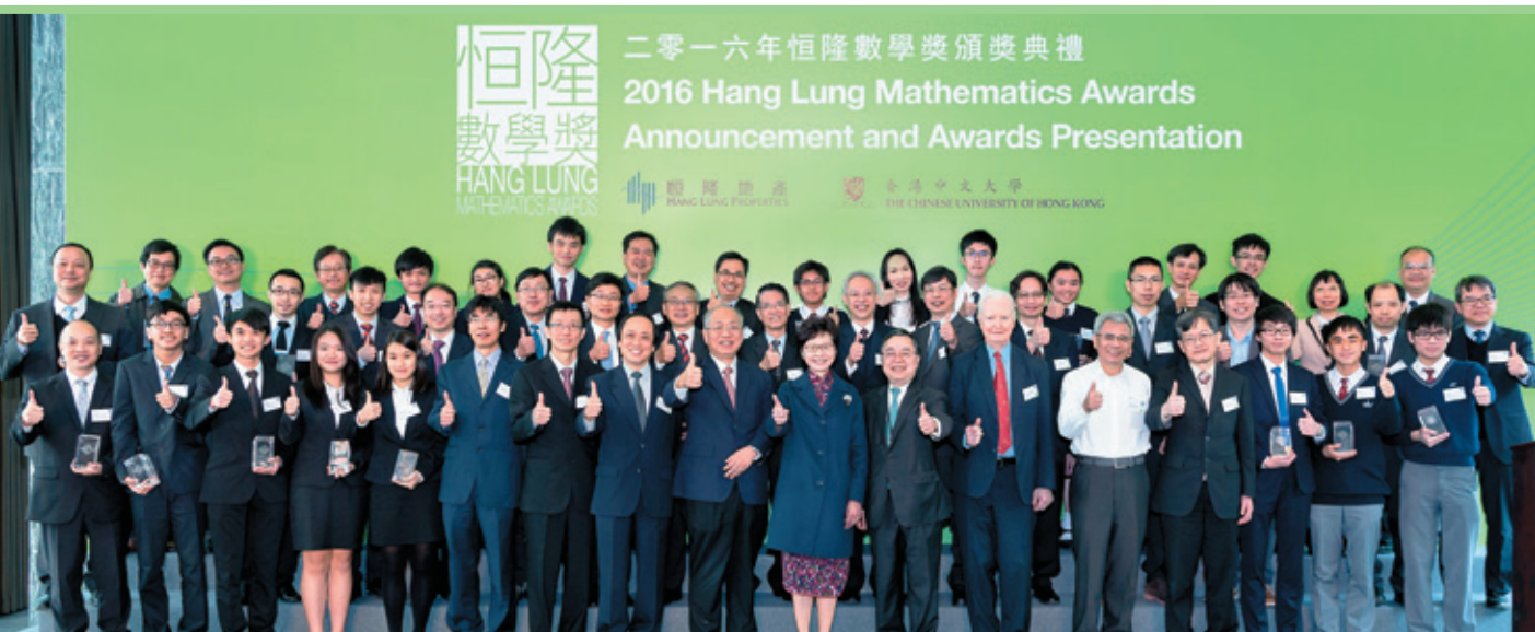
Hang Lung co-organized the biennial landmark event Hang Lung Mathematics Awards (HLMA) with the Institute of Mathematical Science and the Department of Mathematics of The Chinese University of Hong Kong

We constantly leverage the capacity of different organizations to achieve what we cannot achieve by ourselves to the benefit of society. We donated HK$2 million to the Hong Kong Red Cross (HKRC) for the establishment of a multi-function room at their new headquarters, and organized the Hang Lung Blood Donation Day with the support of the HKRC to engage our colleagues' and tenants' participation in this life-saving act.