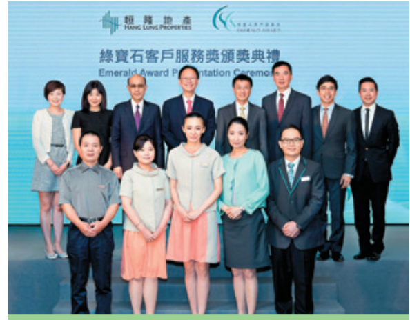
The Emerald Award is established to applaud service excellence among our frontline teams

As of 31 December, 2016, the Company employed 4,720 staff across Hong Kong and mainland China. Total employee costs amounted to HK$1,374 million. We regularly review our remuneration packages based on market conditions to ensure that our remuneration and benefits packages remain competitive in the market. We also comply with the local employment regulations in the jurisdictions in which we operate, with necessary policies set out in our company's Code of Conduct to safeguard an equal, safe, and harassment-free work environment.