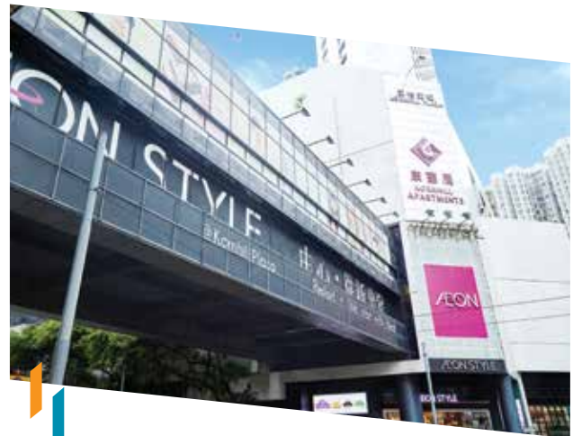
The continued enhancement in the tenant mix at Kornhill Plaza has captured the interest of nearby residents and office workers

With tourist arrivals remaining subdued, Peak Galleria will continue to focus on creating a unique destination and introducing more lifestyle brands and experiential trades, including outlets focusing on lifestyle and wellness, while preparing for the return of tourists.