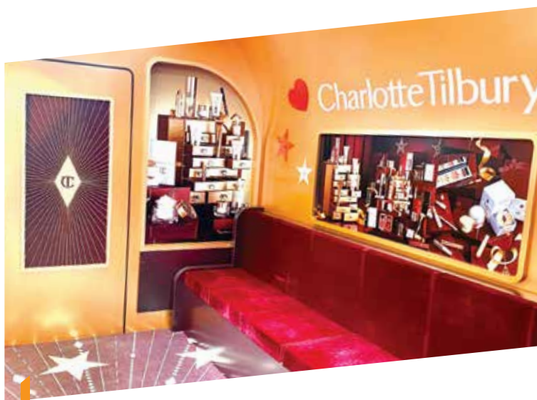
Pop-ups and concept stores are constantly reenergizing Fashion Walk in Causeway Bay