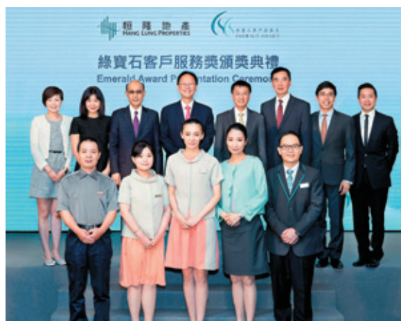
The Emerald Award is established to applaud service excellence among our frontline teams

As of 31 December, 2016, the Company employed 4,720 staff across Hong Kong and mainland China. Total employee costs amounted to HK$1,374 million. We regularly review our remuneration packages based on market conditions to ensure that our remuneration and benefits packages remain competitive in the market. We also comply with the local employment regulations in the jurisdictions in which we operate, with necessary policies set out in our company's Code of Conduct to safeguard an equal, safe, and harassment-free work environment.