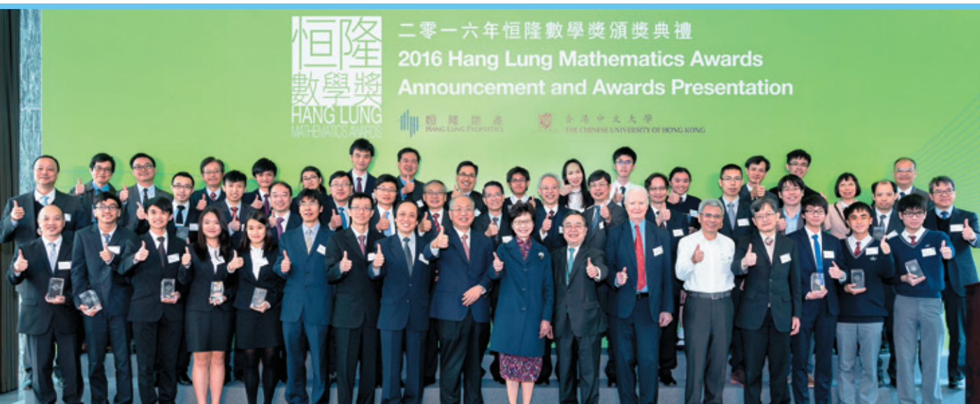
Hang Lung co-organized the biennial landmark event Hang Lung Mathematics Awards (HLMA) with the Institute of Mathematical Science and the Department of Mathematics of The Chinese University of Hong Kong

We constantly leverage the capacity of different organizations to achieve what we cannot achieve by ourselves to the benefit of society. We donated HK$2 million to the Hong Kong Red Cross (HKRC) for the establishment of a multi-function room at their new headquarters, and organized the Hang Lung Blood Donation Day with the support of the HKRC to engage our colleagues' and tenants' participation in this life-saving act.