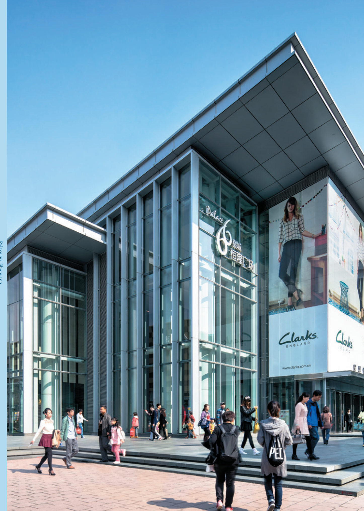
Palace 66, Shenyang