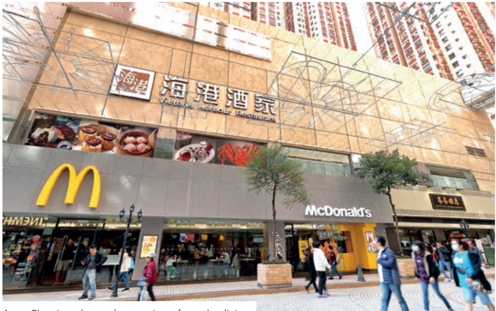
Amoy Plaza introduces a huge variety of popular dining brands to maintain its appeal to nearby residents

On the other hand, medical services providers proved resilient to the downturn, and efforts had been made to attract new tenants from the sector, with two floors of Grand Plaza having been renovated in support of this. The leasing team will also be targeting other sustainable trades to win new business in 2021.