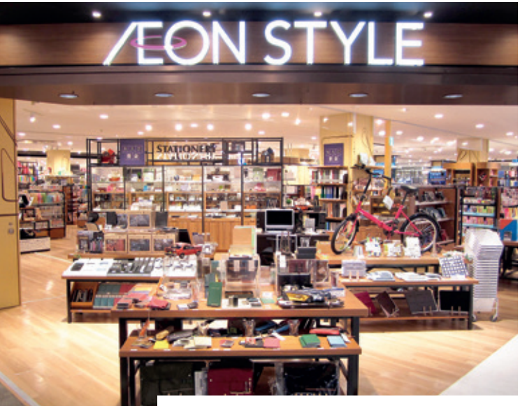
Kornhill Plaza's mall maintained its solid performance in 2020, proving resilient amid the COVID-19 pandemic