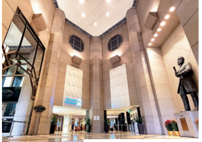
Despite the negative impact of COVID-19, the leasing performance of our Central portfolio remained solid in 2020

occupancy declined by four points to 93% as the COVID-19 pandemic dealt a blow to spending and footfall in the area. Looking ahead, it is envisaged that the new CRM program targeted to be launched in the first quarter of 2021 will help draw consumers and support tenants' businesses.