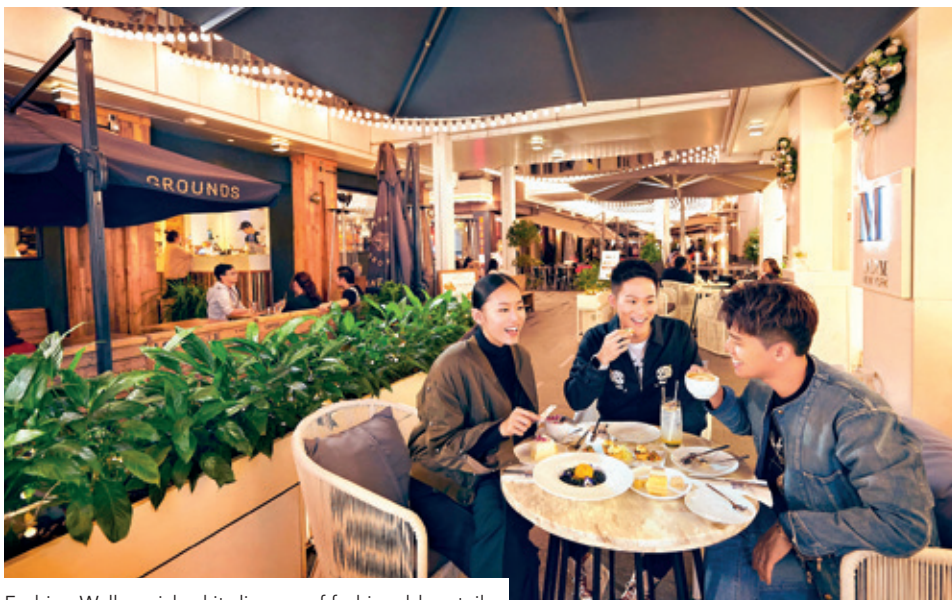
Fashion Walk enriched its line-up of fashionable retail, dining and entertainment outlets in the heart of Causeway Bay in 2020

by openings of Handsome Factory Barber Shop and a new concept by leading hair salon group IL COLPO. The portfolio of exclusive fashion and lifestyle shops was bolstered by additions from DURAS, DELStore, kapok, OKURA, and Sweaty Betty, while the offering for foodies was improved by the introduction of The Alchemist Café, Urban Coffee Roaster, Moo Moo Plus, SAKE SAN and Japanese style dessert brand Saori Pancake. As at the end of 2020, Fashion Walk's