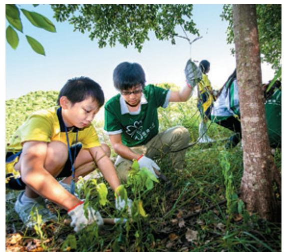
「恒隆綠先鋒」計劃向學生宣揚保護環境的訊息 The Hang Lung Green LEEDers program teaches students the importance of environmental protection