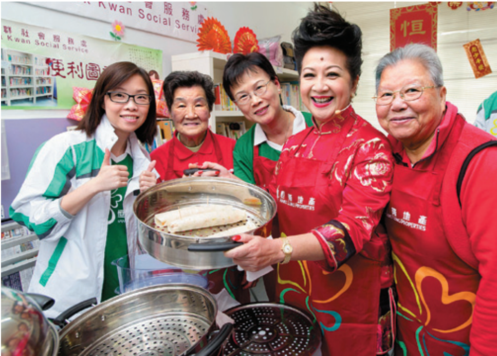
藝人薛家燕和恒隆義工與長者合力烹調賀年菜式，慶祝新春佳節 Volunteers and celebrity Nancy Sit make a festive dish with the elderly to celebrate Chinese New Year