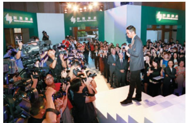
藝人陳豪走上天橋，演繹恒隆前線員工的全新制服 Celebrity Moses Chan is invited to display the new uniforms in a fashion show