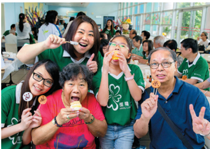
「恒隆一心義工隊」舉辦多元化活動，服務不同社群 The Hang Lung As One volunteer team serves the community by organizing diversified activities

Please refer to our Sustainability Report 2013 for more details on our sustainability performance.