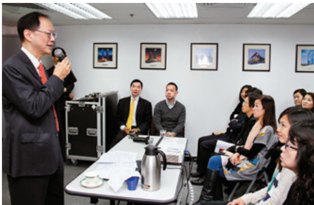
管理層透過員工大會，促進與員工的雙向溝通 Mutual communication with staff is encouraged by senior management through Town Hall meetings

In addition to regular engagement activities, we also engaged with our employees during the year when revamping the uniforms for our frontline colleagues in Hong Kong and mainland China to ensure that they suited the needs of our staff in different areas of our business. The feedback on the new uniforms from both our staff and customers has been positive.