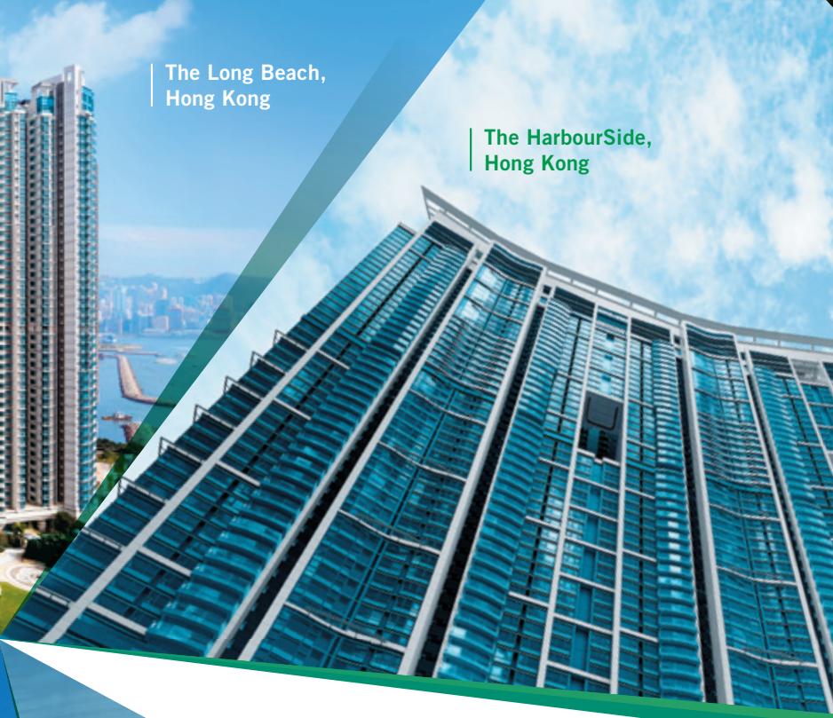
The HarbourSide, Hong Kong