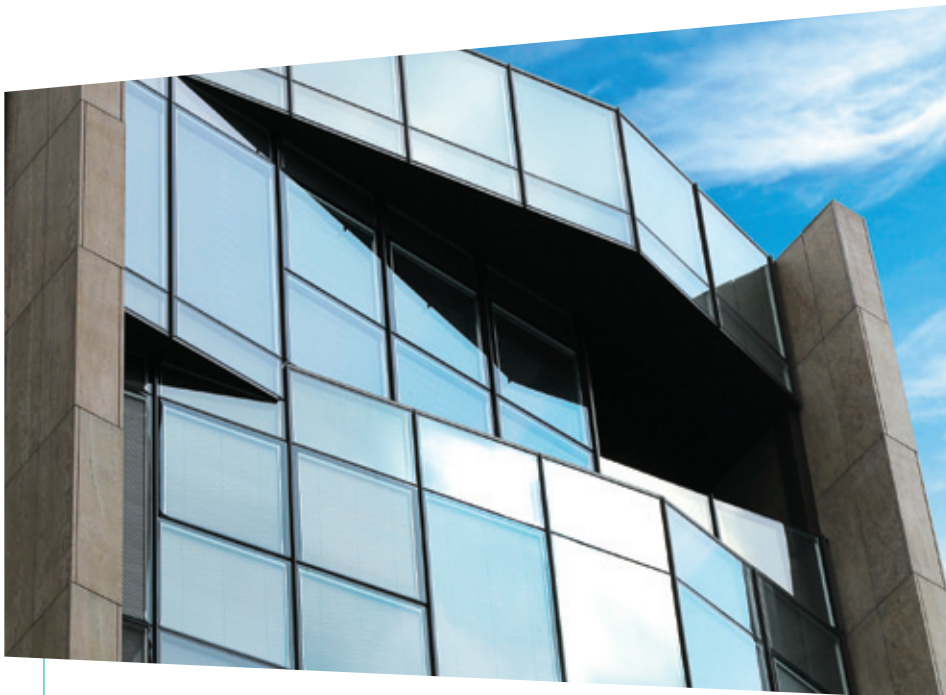
23-39 Blue Pool Road obtained its occupation permit in 2014