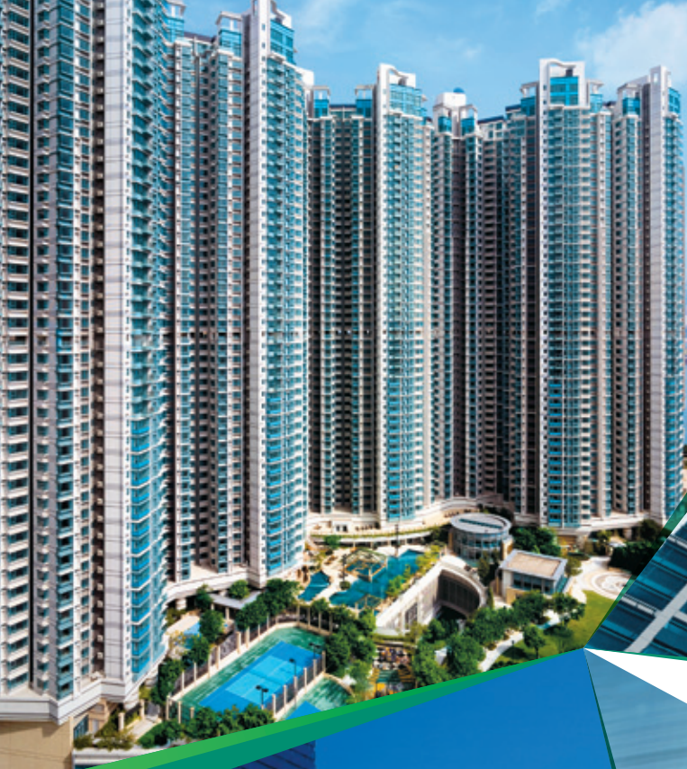
The Long Beach, Hong Kong