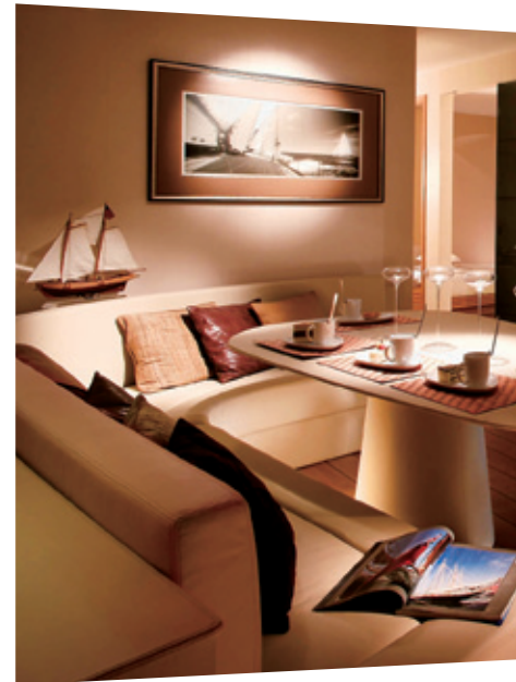
The Long Beach is a high-end residential complex with a prime location in South West Kowloon

We build top quality residential properties in prime locations and take a highly disciplined approach to sales in order to optimize value. The result is that our properties are consistently well received in the market.