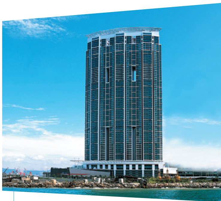
The HarbourSide enjoys panoramic and magnificent views of Hong Kong's Victoria Harbor

Environmental Design (LEED) for Homes program by the U.S. Green Building Council. It is the first project in Hong Kong and on the Mainland to attain this certification and also the largest project on the Mainland to be recognized as to date.