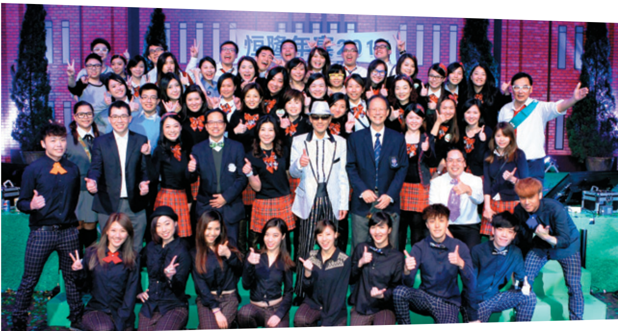
Let's Go Green was the theme of Hang Lung's Annual Dinner 2014

We started collecting data on the environmental performance of our buildings in 2010 and we now have a better understanding of their environmental impacts which is useful information we rely on to enhance our systems accordingly. We are proud to be one of the 64 listed companies that are first-movers in disclosing carbon data through The Carbon Footprint Repository for Listed Companies in Hong Kong, which was co-organized by the Environment Bureau and Hong Kong Exchanges and Clearing Limited in 2014.