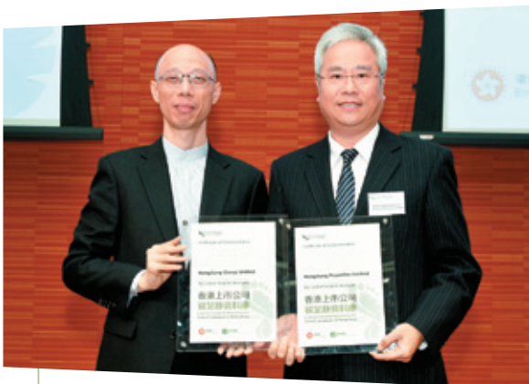
Hang Lung is one of the 64 listed companies that are first-movers in disclosing carbon data through the Carbon Footprint Repository for Listed Companies in Hong Kong

We invest significant resources in environmental equipment and features in our properties. Riverside 66, opened in Tianjin in September 2014, is the latest demonstration of our commitment to green investment. We chose building envelopes to optimize the building's insulation during hot and cool seasons and heat recovery systems that enhance energy efficiency. Energy-efficient lighting and chillers were installed to further optimize energy consumption in the operation of the building. Additionally, we have been successful in our recycling initiatives and have recycled a large variety and high volume of waste. These trends reflect the result of our commitment to attain the Leadership in Energy and Environmental Design (LEED) Gold certification issued by the U.S. Green Building Council across all new projects in mainland China and the benefit of incorporating environmental considerations into the design of the buildings. While Riverside 66 already received the Gold Level certificate under the LEED for Core and Shell Development in 2015, our 10 th project on the Mainland, Heartland 66 in Wuhan, also received the pre-certification gold standard in 2014.