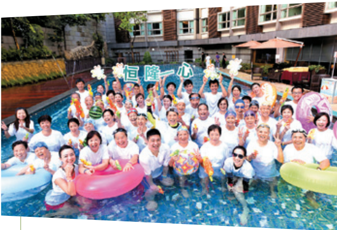
The Hang Lung As One volunteer team organizes a refreshing summer poolside party for 30 elderly people