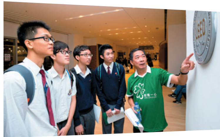
A series of Architectural Tours leads over 70 secondary school students to observe and study Hong Kong's distinctive architectural landmarks