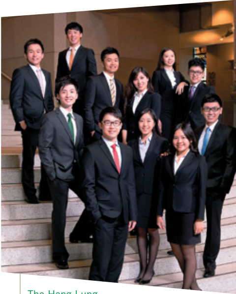
The Hang Lung Management Trainee program attracts numerous university graduates from Hong Kong, the Mainland and overseas to apply