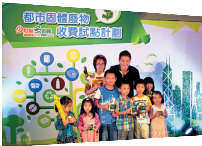
Amoy Gardens Management Office provides extra waste recycling facilities and organizes promotional activities to encourage residents to participate in the Municipal Solid Waste Charging Pilot Scheme