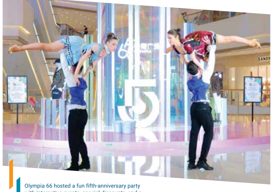
with interactive events, special discounts, and a lucky draw involving more than 150 tenants