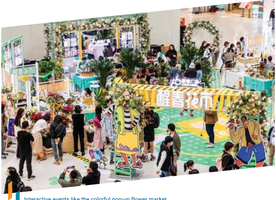
Interactive events like the colorful pop-up flower market stimulated an increase in footfall at Palace 66

Moving into 2022, the mall will focus on enhancing food and beverage offerings by introducing more varied and in-trend dining options, while working on attracting more premier fashion and accessories brands into the mix.